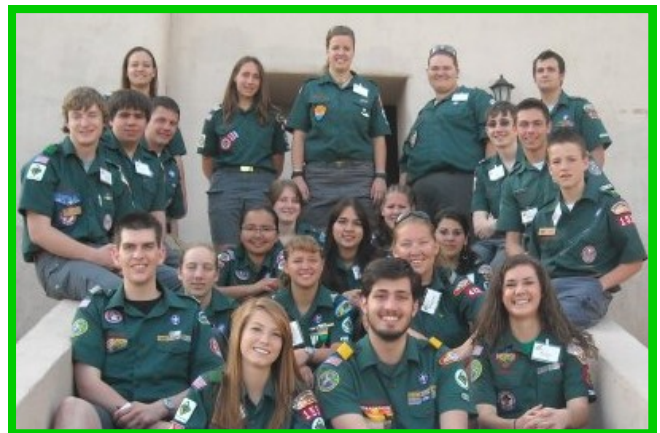
Participants and advisors for the conference.